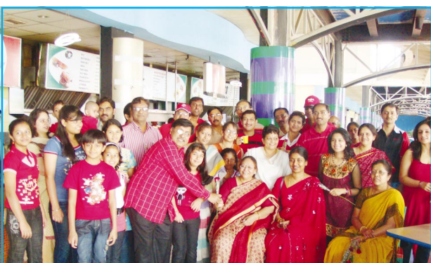
Valentine Day Celebrations