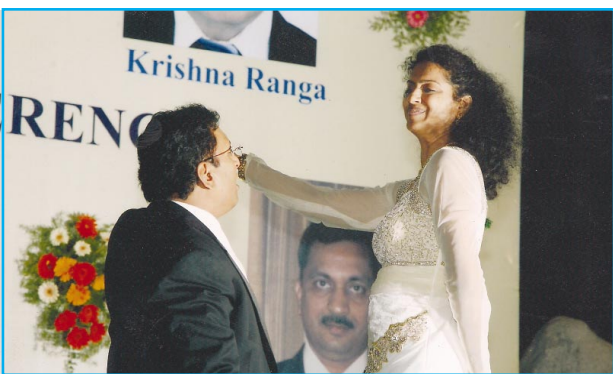
Dance Performance at District Conference at Jalvihar