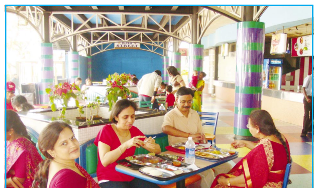
Valentine Day Celebrations