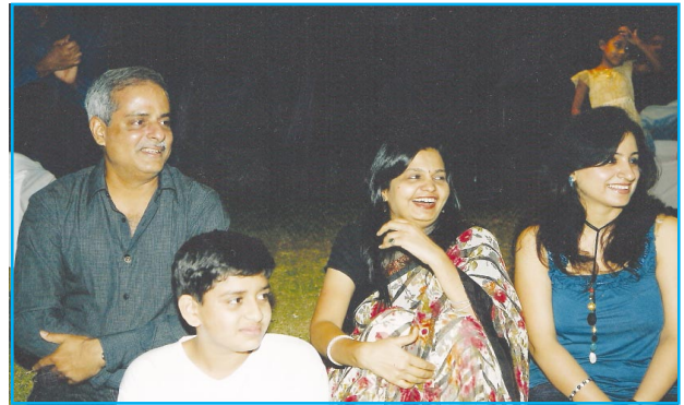
Members enjoying at District Conference at Jalvihar