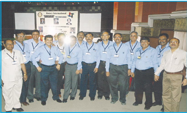
Club delegates at District Conference