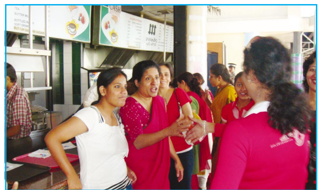
Valentine Day Celebrations