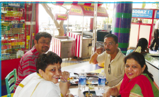
Valentine Day Celebrations