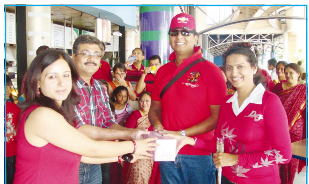
Valentine Day Celebrations